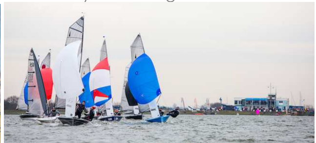
Adult and youth sailing